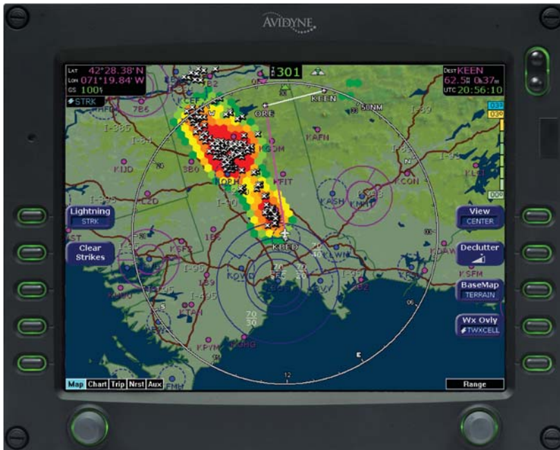
EX5000 MFD with Cell/Strike Mode.