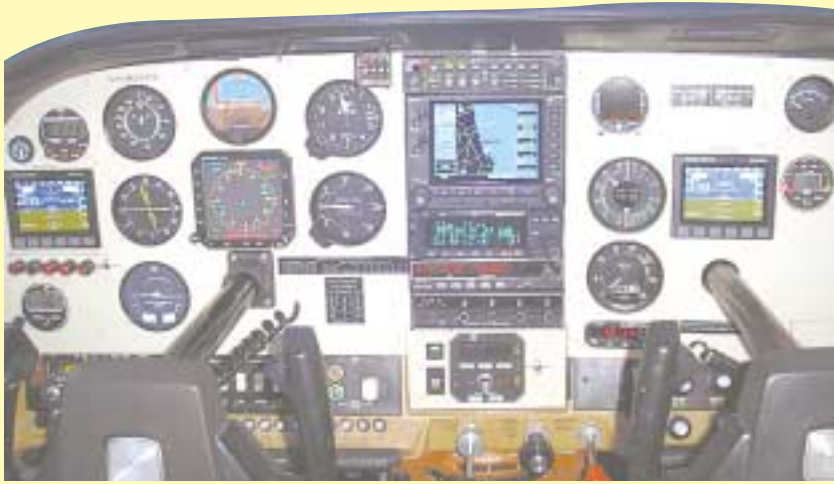
1975 CESSNA 210L

LOOKING FOR A RETROFIT TO SUIT YOUR AIRCRAFT? CALL NOW FOR A NO OBLIGATION ESTIMATE. COMPLETE AVIONICS HAS THE COMBINATION TO SUIT ANY BUDGET