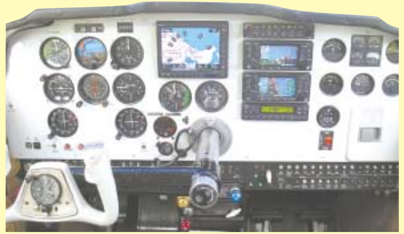
1985 BEECHCRAFT A-36 BONANZA